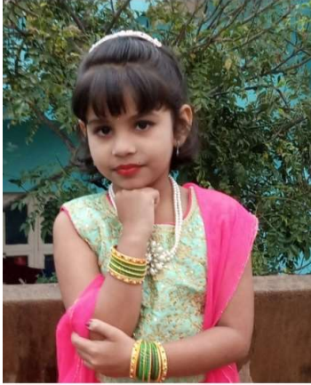
III – Spandana